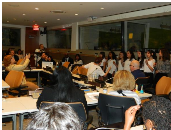
Brooklyn Children's Glee Club Chorus