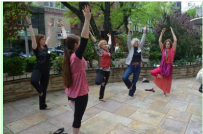
Humanitarian Mission Training, May 2014, chakra balancing exercises