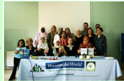
ATOP MW in Jordan

"Meaningfulworld Humanitarian Empowerment and Peace Building Mission is at its finale, I am in the airplane flying back home, although spiritually so enriched, I am feeling a deep sadness. Memories of my childhood growing up as an Armenian in Aleppo, Syria, had surfaced, Especially in this mission where we worked in Palestine, Jordan, and At the border of Syria, with Syrian refugees who sided with the Islamic extremists opposition..." Click here to read the press release.