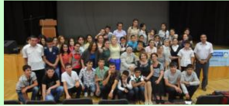
Diramayr Vocational School