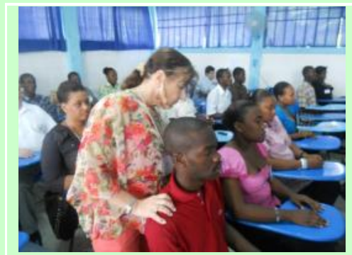
Dr. Ani conducting relaxation exercises

Haiti has been in a state of turmoil for decades. The problems the people of Haiti face on a day-to-day basis are enormous. According to reports from globalissues.org , Haiti is ranked as one of the world's poorest countries when it comes to economy, healthcare, and resource distribution (Shah, 2010). Even acquiring basic necessities such as food and untainted water is a daily struggle. Cholera has ravaged Haiti since the Earthquake back in 2010 and as many as 8,450 people have died from contaminated water (UN, 2014). These unresolved issues leave the people of Haiti in constant fear, unable to live their daily lives safely and in good physical and emotional health. To continue reading the press release click here.