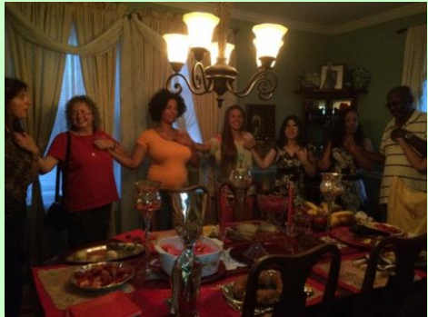
Heart-to-heart Circle of gratitude around desert table