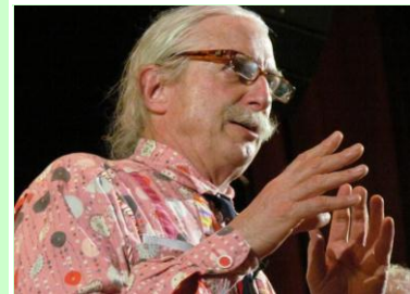
Patch Adams, "The most radical at anyone can commit is to be happ

The Bronx Museum of the Arts 1040 Grand Concourse Bronx, NY 10456