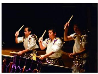
Inamori Art Project

Come celebrate UN International Day of Peace with ATOP Meaningfulworld.