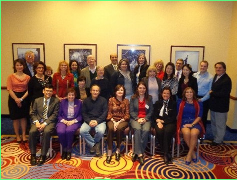
APA Division 52 International Psychology at the Eastern Psychological Association