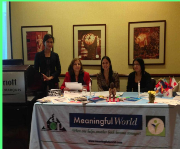
ATOP Meaningfulworld at EPA 2013 in NYC.